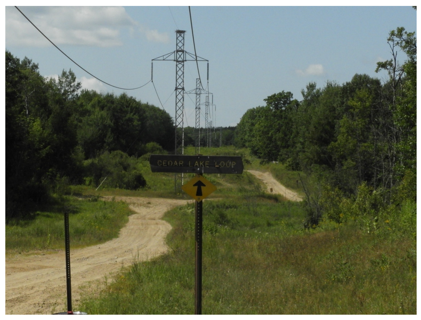
A dirt road in Cass County, Minnesota, just east of the Moose River, before Enbridge started construction on Line 3.