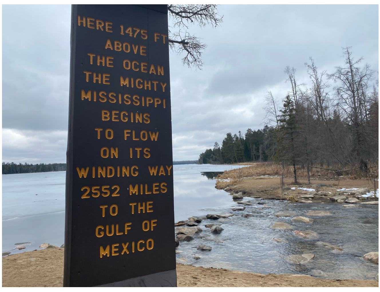
The sign by the Headwaters of the Mississippi River, connecting to Lake Itasca, Minnesota.