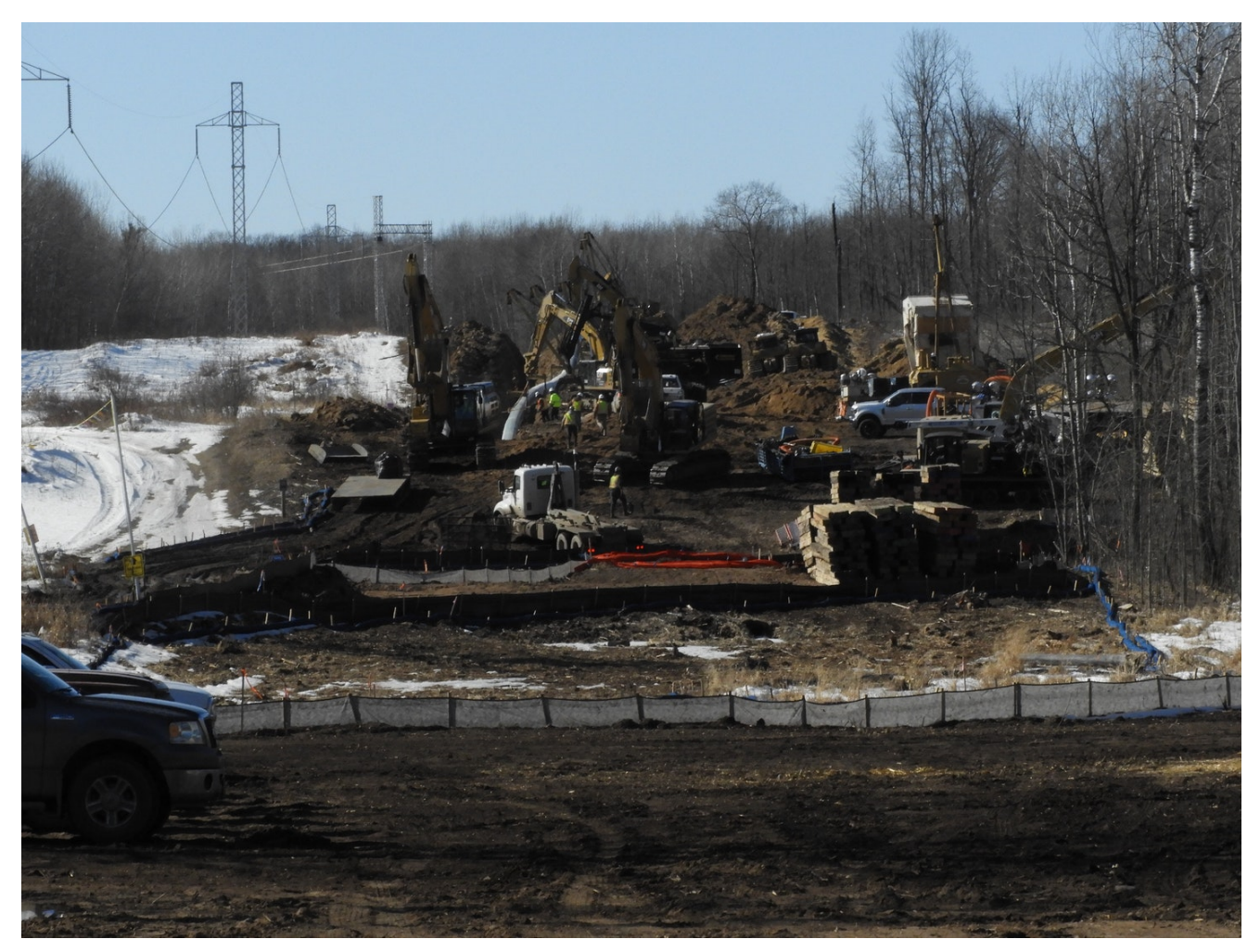
That same spot in Cass County, Minnesota, just east of the Moose River, after Enbridge started construction on Line 3.

We met Aimee, a dogged monitor and documenter of Line 3's construction for the group <u>Watch the Line MN</u>, through a woman named <u>Rita Chamblin</u>. Rita is a liason for <u>Minnesota</u> <u>Interfaith Power & Light</u> who also holds trainings on how to legally monitor Line 3's construction.